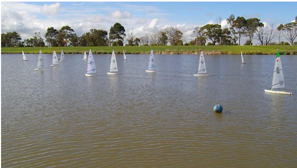
2015 Victorian RC Laser State Titles @ Patterson Lakes Radio Model Yacht Club