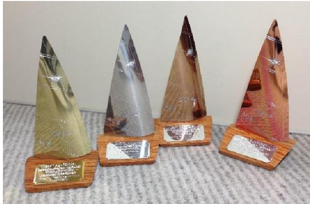
Champion Trophy, Second and Third Places, & Sportsman's Trophy donated by SailPrizes Sailing Trophies