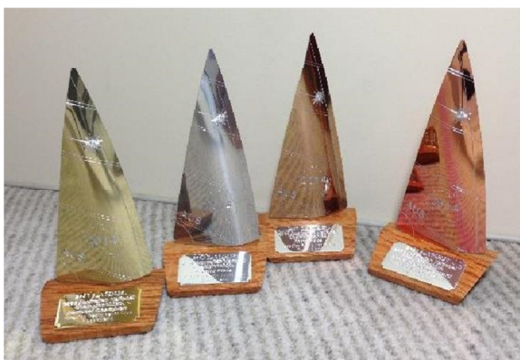
Champion Trophy, Second and Third Places, & Sportsman's Trophy

Trophies will be presented at a ceremony at 4:30 pm on Sunday 28 April 2019.